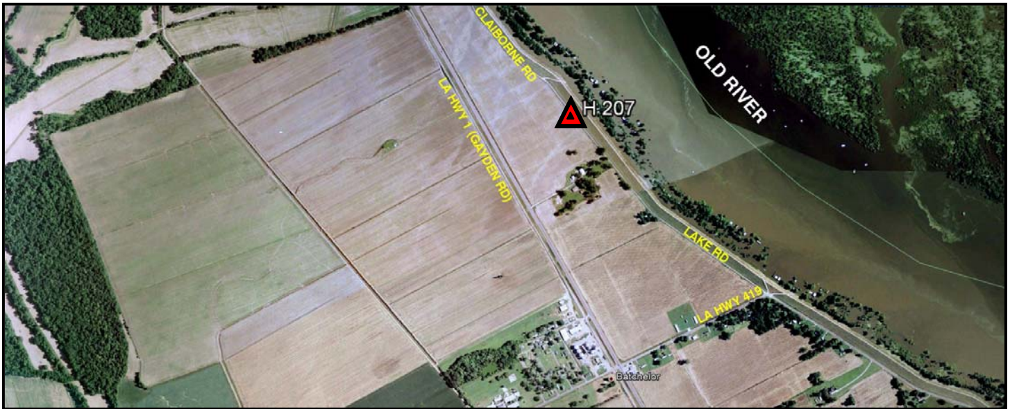
VICINITY MAP Scale: 1" = 2000'