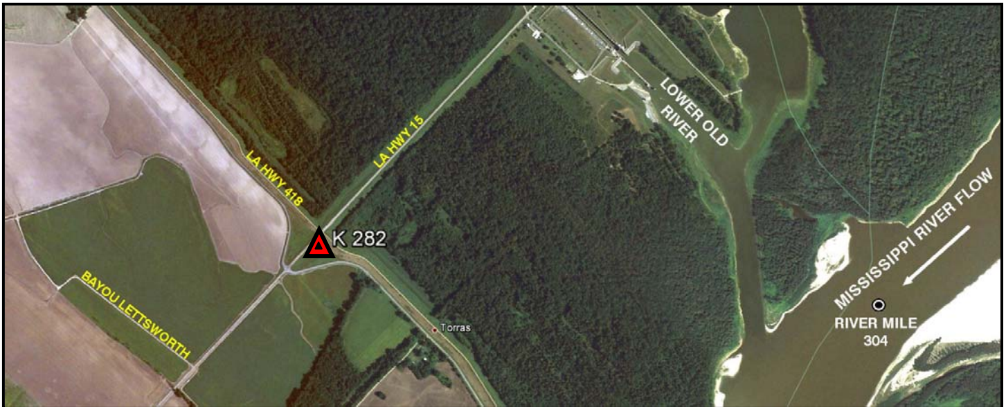
VICINITY MAP Scale: 1" = 2000'