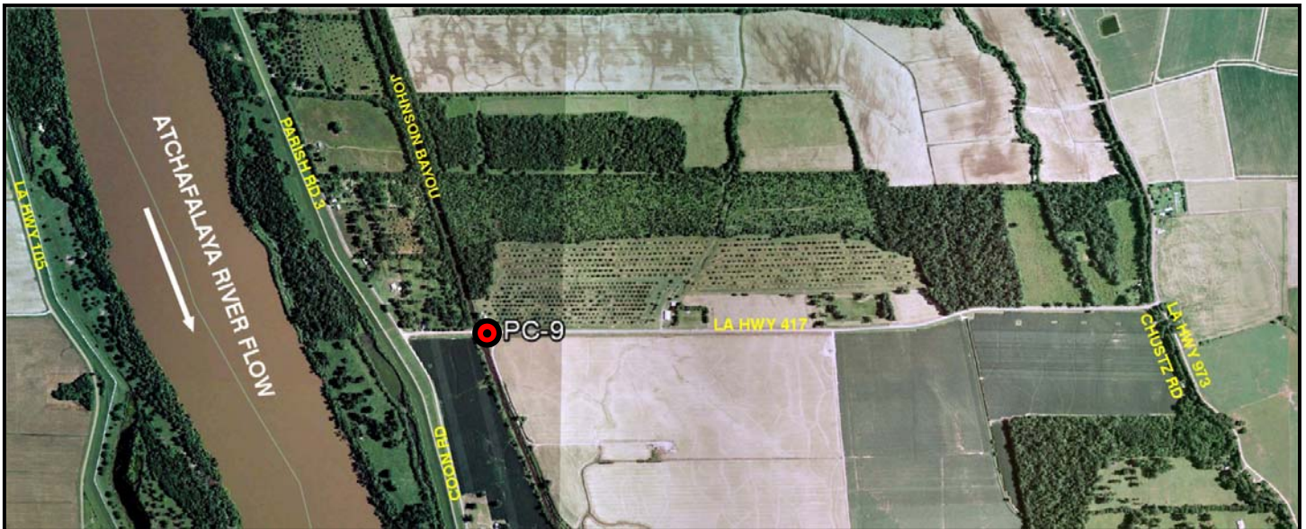
VICINITY MAP Scale: 1" = 2000'

Monument Location: The station is located in Pointe Coupee Parish, LA, 5.0 miles North of Melville, LA, 6.9 miles Southeast of Woodside, LA and 7.3 miles Southwest of Batchelor, LA. To reach the station from the intersection of LA HWY 419 and LA HWY 1, travel West on LA HWY 419 for 2.9 miles to LA HWY 417, turn left on LA HWY 417 and travel South for 6.8 miles to the station on the left just before the bridge crossing Johnson Bayou.