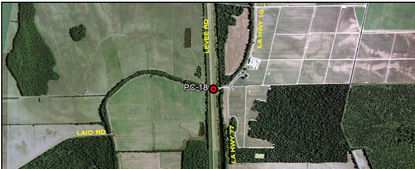
VICINITY MAP Scale: 1" = 2000'